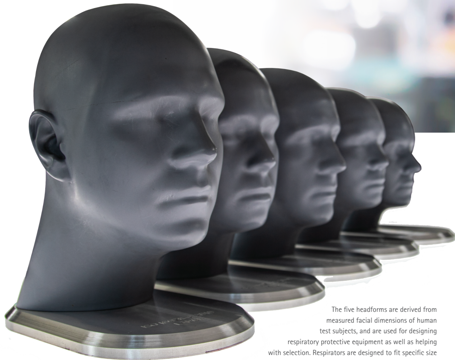
The five headforms are derived from measured facial dimensions of human test subjects, and are used for designing respiratory protective equipment as well as helping with selection. Respirators are designed to fit specific size designations and are tested on the relevant headform size.

Face size and shape are important considerations when selecting RPE. The mask must fit the wearer's facial features to create a seal and provide protection. Respirators are available in a range of sizes to fit different facial dimensions. To ensure a good fit, face shape and size must be considered and, if possible, measured prior to selection.